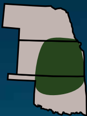
Area of primary adaptation