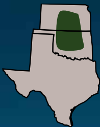
Area of primary adaptation